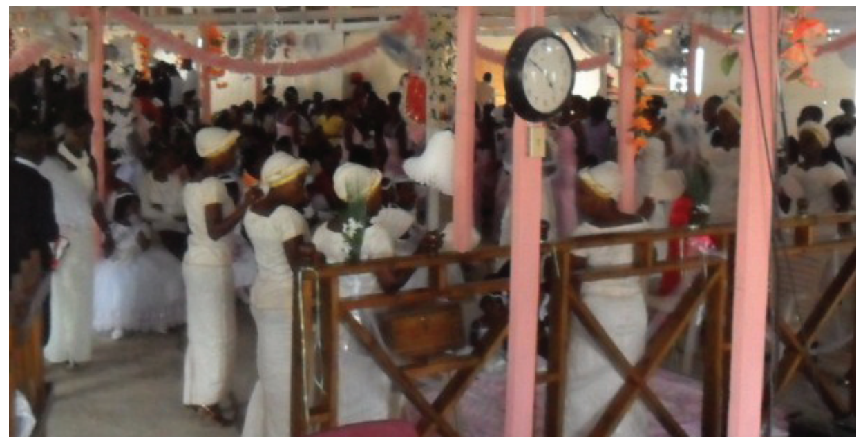
Performing Mass Wedding Ceremonies in Neply

When the poverty in Haiti, there are many people who will never be able to experience a wedding! When people fall in love, they often end up living together their entire life because they are so extremely poor. In the Haitian culture as Christians, if you are living together and unmarried you are not allowed to serve in the church in any way! You are not even permitted to clean the sanctuary until you make things right before God!