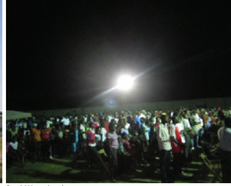
Eager to get working