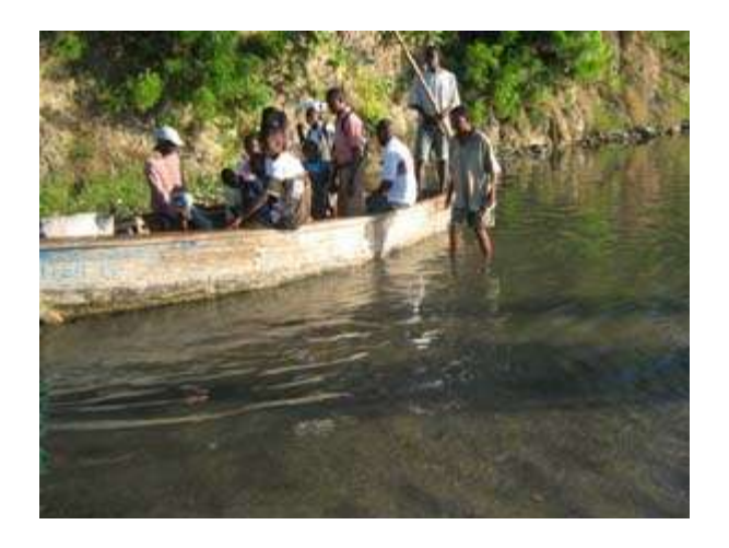
Road Washed Away by Tropical Storm

There was also one area where the population is estimated at 250,000 The people were not happy because they said the police force there is made up of only 1 police officer with one motorcycle and that motorcycle is broken now and needs repairs.