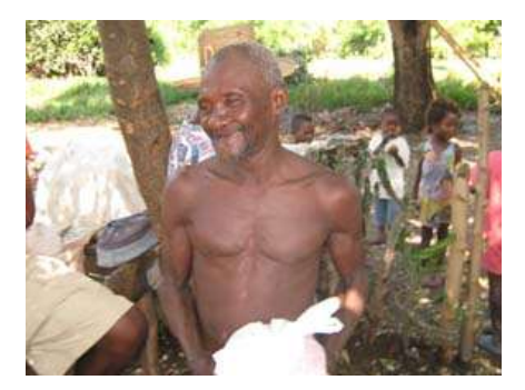
The Elderly People Need Our Help