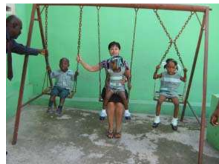
Place L'or School

The Trade School Building is now <u>completed</u> and phase one of the school has been opened. This project now will be self-supporting and students and classes will be added each year until it is operating to full capacity. It is the only professional school of this quality in the entire area. Below are just a few photos but the building is large with 3 stories to teach and train students.